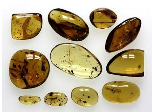
Mexican amber nuggets