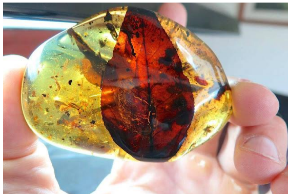
A truly spectacular leaf in Myanmar Amber old 100 million years

Caribbean Amber is Amber from the island of Hispaniola, consisting of Haiti and the Dominican Republic; it is the only island in the Caribbean where Amber Retinite has been discovered and is mined. Dominican Amber is found in various natural colors, among them fluorescent green and blue. (See Photo in the upper Right Hand Corner of the first page of the Types of Amber)