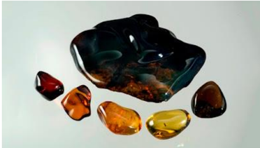
Amber typical varies from light to dark orangy brown

Black Amber - aka Oltu Stone, is a kind of jet found in the region around Oltu Town within Erzurum Province, eastern Turkey. The organic substance is used as semi-precious gemstone in manufacturing jewelry.