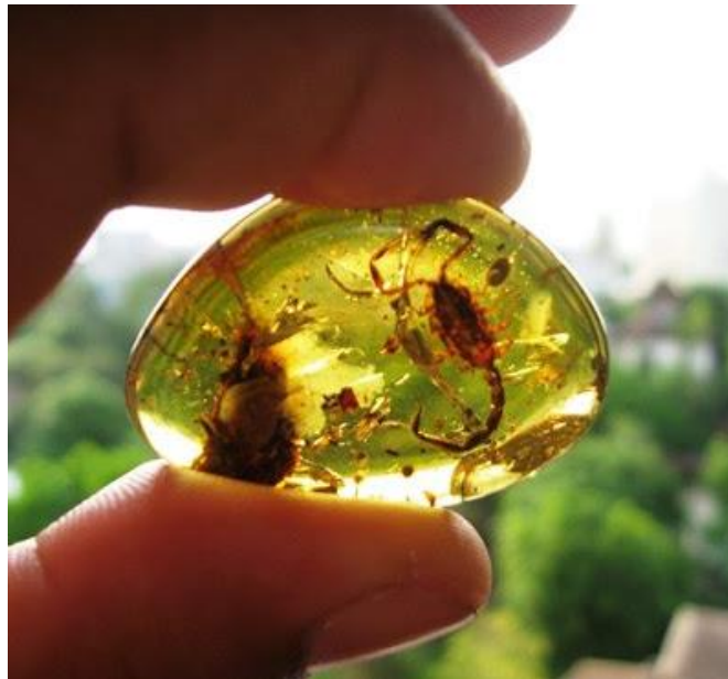
Burmese amber (99- 112 myo) with huge perfect scorpion

Burmese Amber - also known as burmite, is a Cretaceous age amber up to 99 million years old found mainly in the Hukawng Valley, Kachin State, Myanmar (Burma)