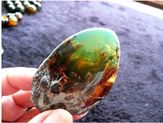
Green Amber from Dominican Republic

Green Amber like its yellow and blue counter parts release a natural scent which is pleasant to the nose. This fragrance can be enhanced by adding nitric acid to a melted Green Amber. Although this is inadvisable for those Ambers that are already set as jewelries. Green Amber when worn against the skin produces a very pleasant scent which is piney and soft.