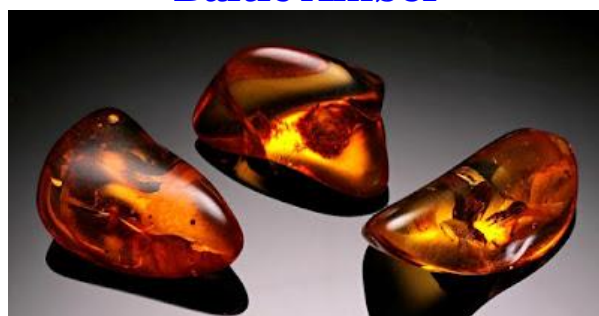
Baltic amber.

Baltic Amber – Is the most common Amber variety, found along the shores of a large part of the Baltic Sea. It dates from 44 million years ago (during the Eocene epoch). It has been estimated that these forests created more than 100,000 tons of Amber. Baltic Amber includes the most species-rich fossil insect fauna discovered to date.