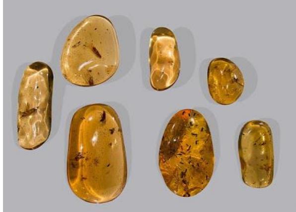
Copal from Madagascar with spiders, termites, ants, elateridae, hymenoptera, cockroach and a flower

Copal is a name given to tree resin from the copal tree Protium copal (Burseraceae) that is particularly identified with the aromatic resins used by the cultures of pre-Columbian Mesoamerica as ceremonially burned incense and other purposes.