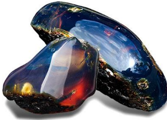
Blue Amber from Dominican Republic

Blue Amber is Amber exhibiting a rare coloration. It is most commonly found in the Amber mines in the mountain ranges around Santiago, Dominican Republic, but also in the eastern parts of the Dominican Republic. Although little known due to its rarity, it has been around since the discovery of Dominican Amber.