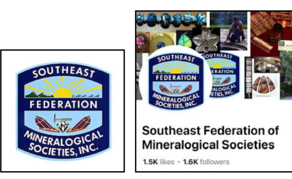
Don't forget to update links to the SFMS website Links to the old SFMS website will be going away in January. Please make sure any links you have to the SFMS website point to the new website: <u>https://</u> www.southeastfed.org