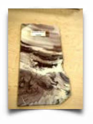
Blue Mountain Jasper